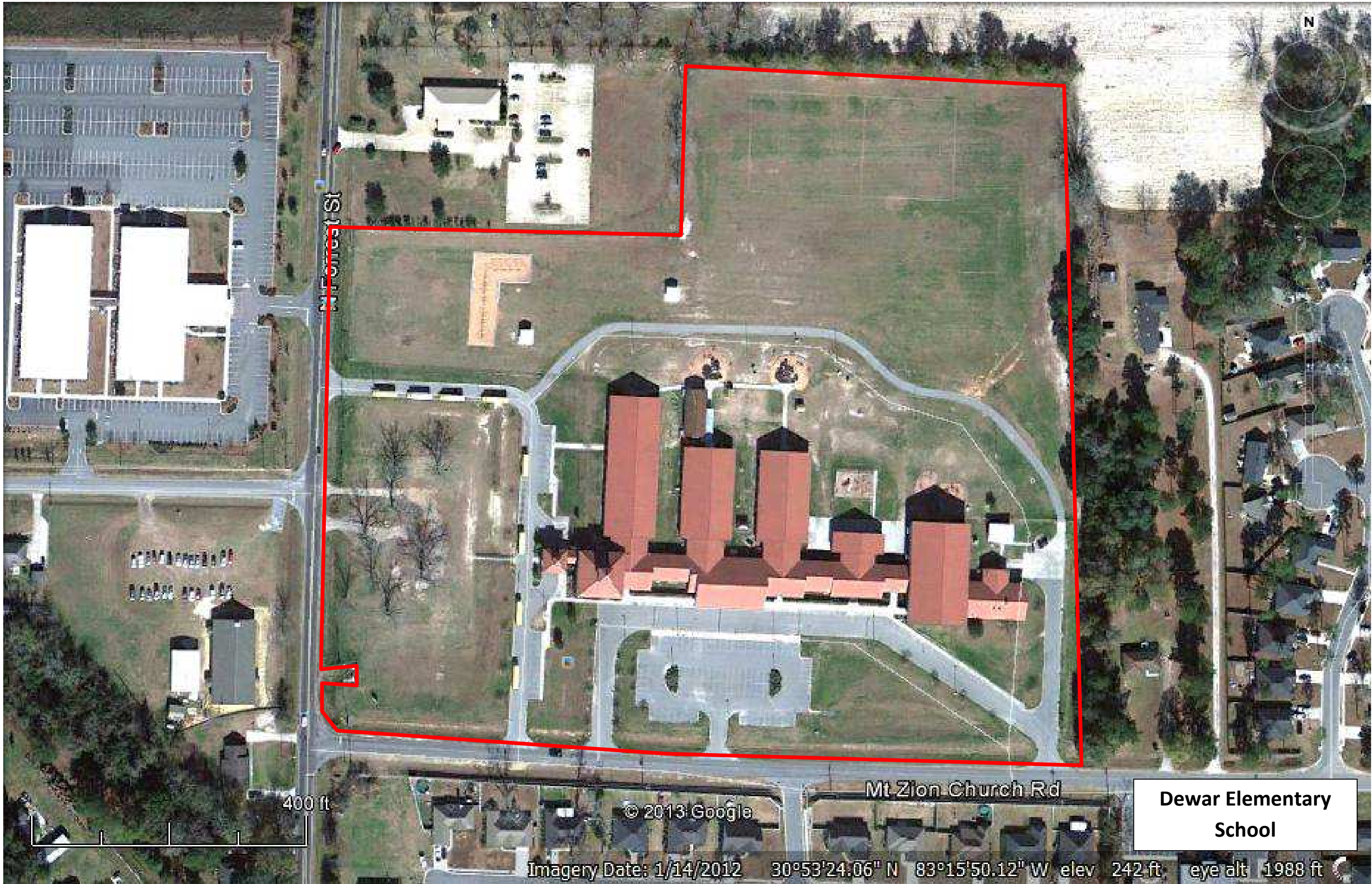
Dewar Elementary School

Imagery Date: 1/14/2012 30°53'24.06" N 83°15'50.12" W elev 242 ft eye alt 1988 ft